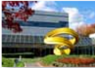
INNOVATION PARK Charlotte, NC