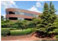
WASHINGTON BUSINESS PARK Lanham, MD