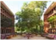
CENTURY PLAZA Columbia, MD