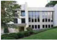
BECO WEST Rockville, MD