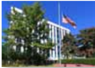
INTERNATIONAL TOWER BUILDING Linthicum, MD