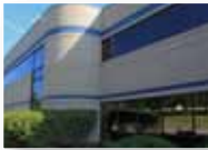
DORSEY BUSINESS CENTER I & III Elkridge, MD