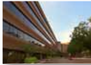
HALLMARK BUILDING Herndon, VA