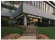
BECO BUILDING Rockville, MD