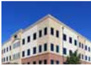
AIRPORT OVERLOOK Linthicum, MD