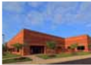
THREE PONDS BUSINESS PARK Columbia, MD