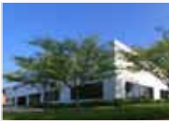
SOUTHGATE BUSINESS CENTER Chantilly, VA