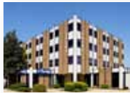
WHITE OAK Silver Spring, MD

EXPLORE THE OPPORTUNITIES & GROW WITH BECO MANAGEMENT.