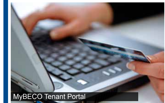
MyBECO Tenant Portal