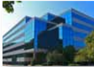
POPLAR RUN Alexandria, VA