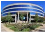
FIFTY WEST Fairfax, VA