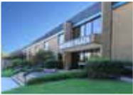
AIRPORT INVESTMENT Linthicum, MD

With offices in Maryland, Northern Virginia & Charlotte, North Carolina, BECO is positioned to provide you with our first class services and amenities in multiple locations.