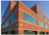
HERNDON SQUARE Herndon, VA