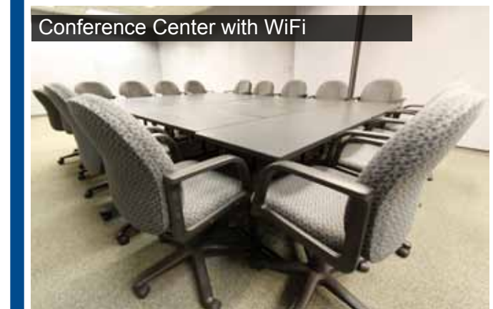
Conference Center with WiFi