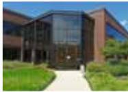
BECO PARK Lanham, MD