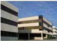
SECURITY OFFICE PARK Baltimore, MD