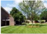
MONTGOMERY VILLAGE Gaithersburg, MD