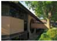
CRYSTAL HEIGHTS Columbia, MD